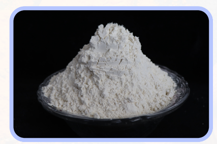
White Onion Powder