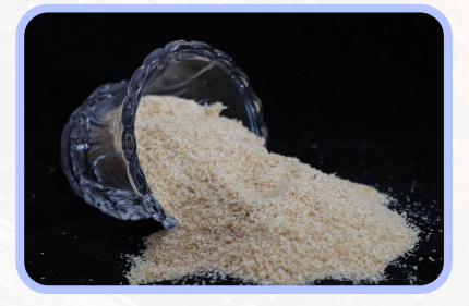
White Onion Granules