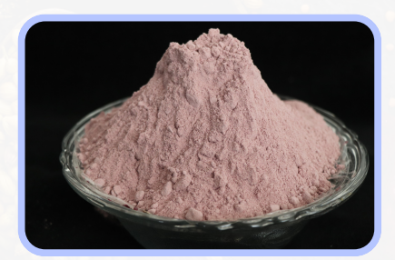
Red Onion Powder