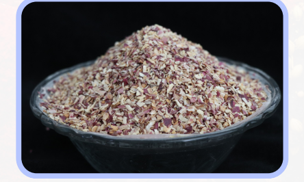
Red Onion Minced