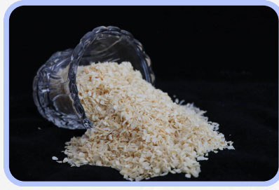
White Onion Chopped