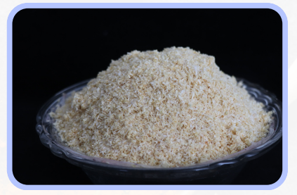
White Onion Granules