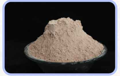
Pink Onion Powder