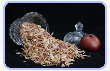
Pink Onion Flakes