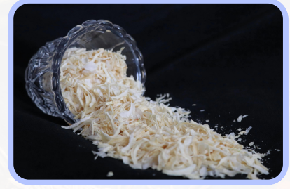
White Onion Flakes