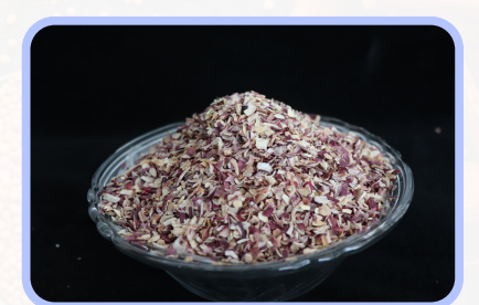
Red Onion Chopped